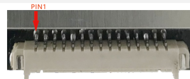
15 PIN W-TO-B Connector, 1.25mm